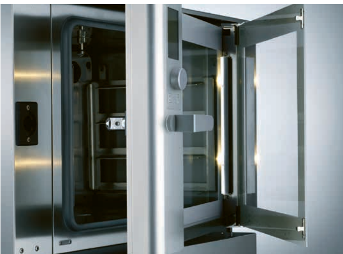
Hinged glass front plate