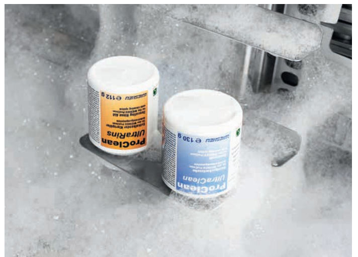
ProClean automatic cleaning system